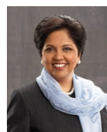
PAST-CHAIR Ms. Indra Nooyi Chairman & CEO PepsiCo, Inc.