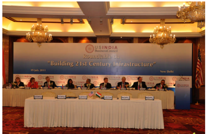
USIBC's Roundtable on Building 21st Century Infrastructure