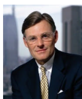
CHAIRMAN Mr. Harold "Terry" McGraw III Chairman, President & CEO McGraw-Hill Companies